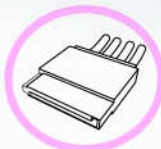
Serial ATA Hard Drive Power Connectors. (x2)