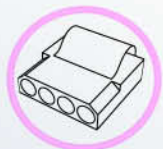
EZ-Grip Connectors. (x8)